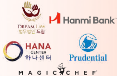
Table Sponsors ($1,250+)